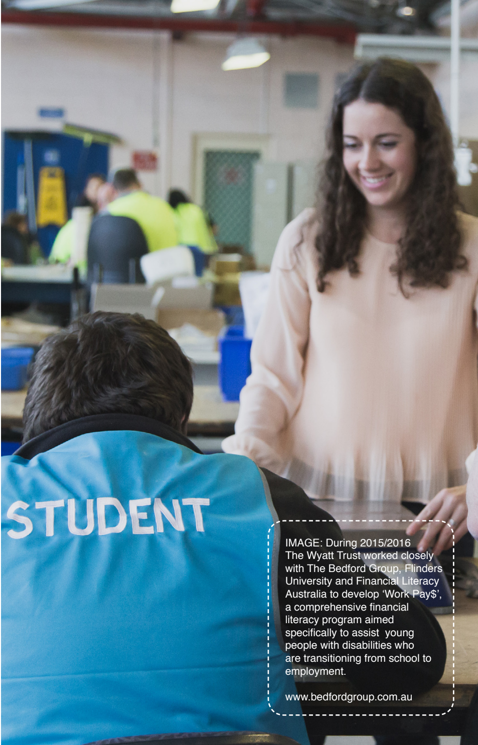
IMAGE: During 2015/2016 The Wyatt Trust worked closely with The Bedford Group, Flinders University and Financial Literacy Australia to develop 'Work Pay$', a comprehensive financial literacy program aimed specifically to assist young people with disabilities who are transitioning from school to employment.

ACH Group Adelaide University, Centre for Housing, Urban and Regional Planning Australian Industrial Transformation Institute (AITI) BDO Blackbird IT Community Business Bureau Community Centres SA Financial Counselling Australia Financial Literacy Australia Jardine Lloyd Thompson JastWorks Kwik Kopy Norwood Macquarie Private Wealth Philanthropy Australia Planet Earth Films Shelter SA Social Impact Investment Network SA South Australian Council of Social Service South Australian Financial Counselling Association Together SA University of South Australia Business School