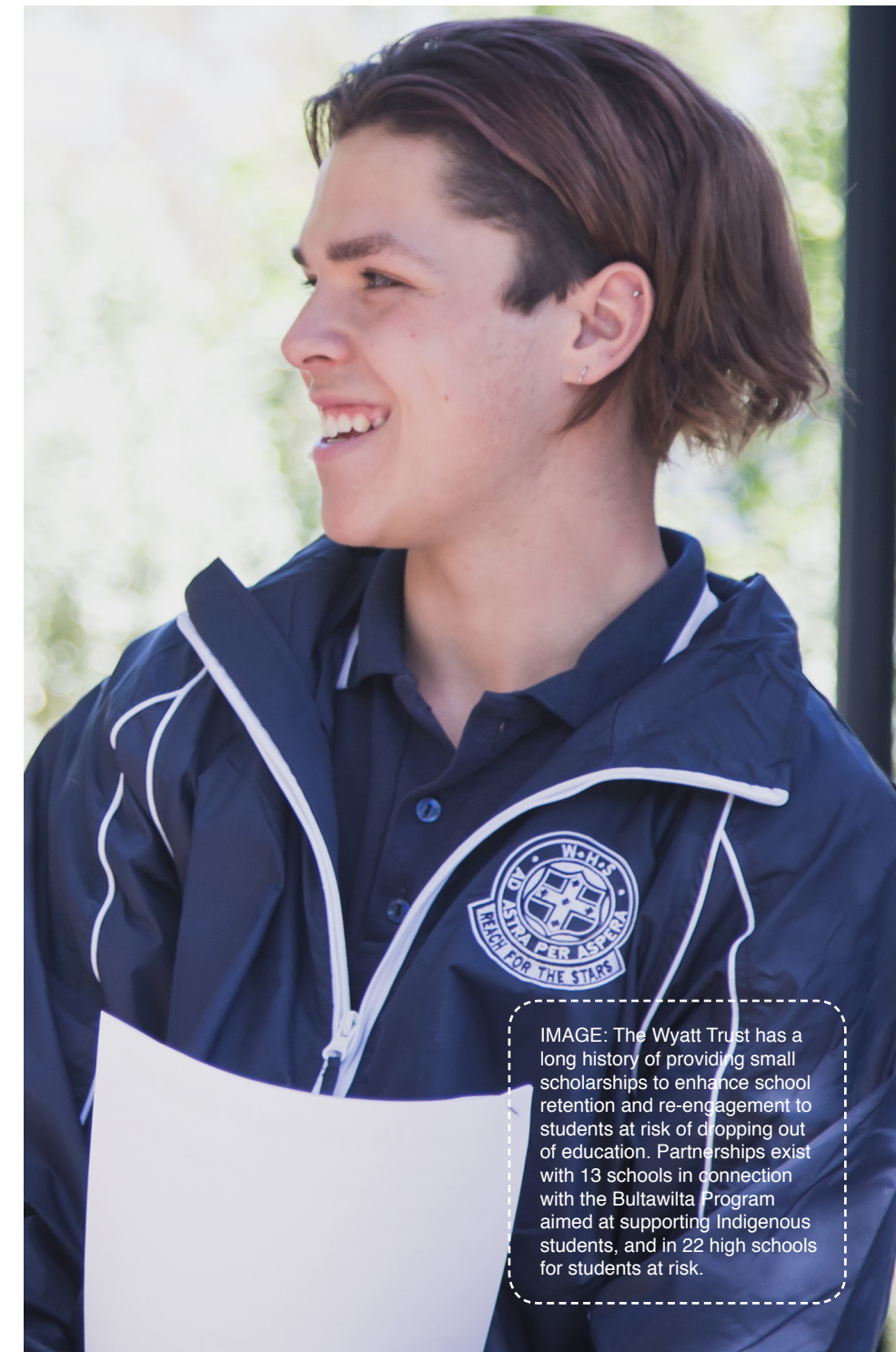
IMAGE: The Wyatt Trust has a long history of providing small scholarships to enhance school retention and re-engagement to students at risk of dropping out of education. Partnerships exist with 13 schools in connection with the Bultawilta Program aimed at supporting Indigenous students, and in 22 high schools for students at risk.